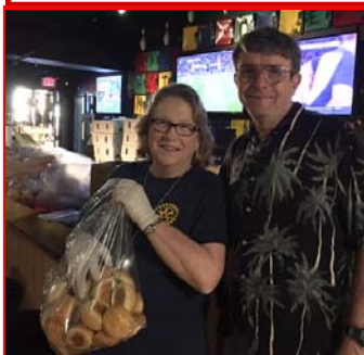
More Christmas Basket Pictures that came in late.